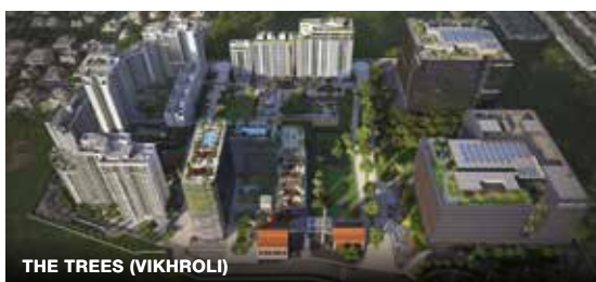
THE TREES (VIKHROLI)

In the last five years, Godrej Properties has received over 200 awards and recognitions, including the "Premium Real Estate Company of the Year" at the Corporate LiveWire Awards 2017, the "Professional Excellence in Real Estate" at the ABP News Real Estate Awards 2016, the "Real Estate Company of the Year" at the Construction Week India Awards 2015, the "Most Reliable Builder" at the CNBC AWAAZ Real Estate Awards 2014, the "Innovation Leader in Real Estate" award at the NDTV Property Awards 2014, and the "Popular Choice - Developer of the Year" award at the ET NOW Awards in 2013.